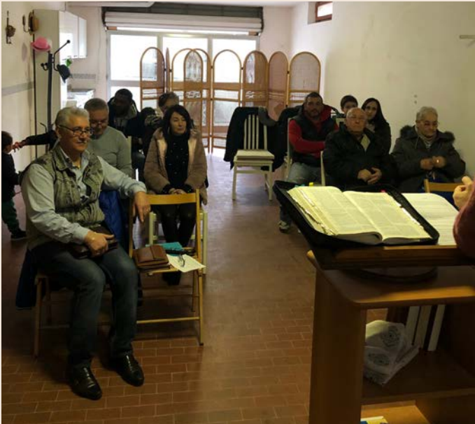
Gathering in a garage

Despite these bad moments a small group of faithful brethren resisted, stuck together and kept the light on.