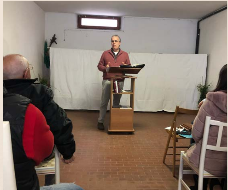
Preaching in Matelica

The congregation has only 15 members, and as the church in Philadelphia in Revelation, I can say about them: "I know that you have little strength, yet you have kept my word and have not denied my name" (Rev 3:8.)