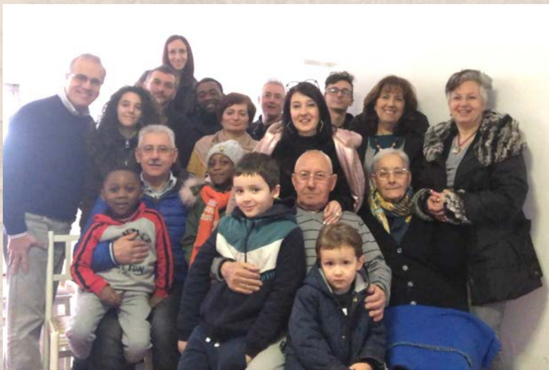
The congregation in Matelica

Once a strong congregation with a beautiful Church building, a full-time preacher, and many active members, the small and neat city of Matelica (about a 3 hour drive from Rome) has been slowly recovering from a terrible misfortune.