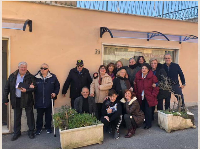
Left - Preaching in Anzio / Below - The congregation in Anzio

Please pray the Lord that this small congregation might have the strength and the faith to preach the Gospel with His power.