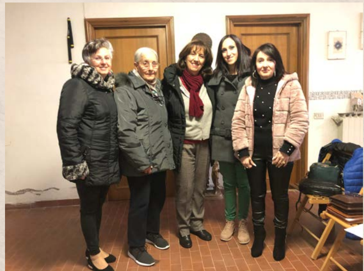
The women of Matelica